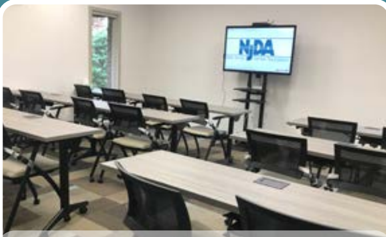
CONFERENCE ROOM A

53" Smartboard - no amplified sound otherwise