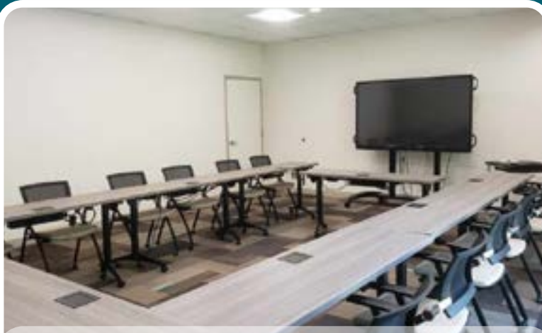
CONFERENCE ROOM B

75" Smartboard - no amplified sound otherwise